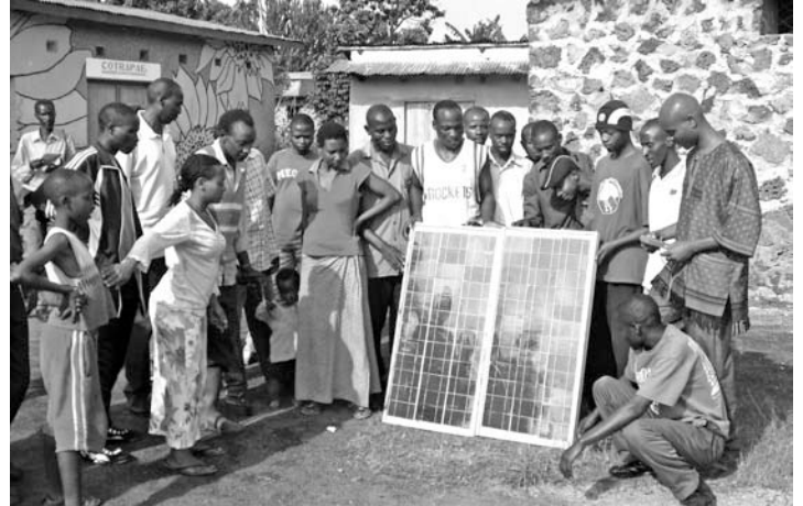
Testing the first two PV modules made in Rwanda. These modules will be installed on the cooperative building on the left.

I never asked and nobody told me, so I have no idea who in the cooperative are Hutu and who are Tutsi. It is completely unimportant to us now.