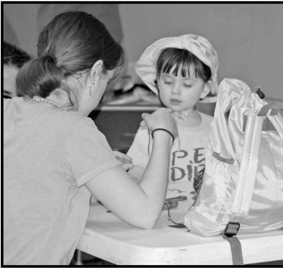
Windover Arts Center helps create spring hats with recycled materials.