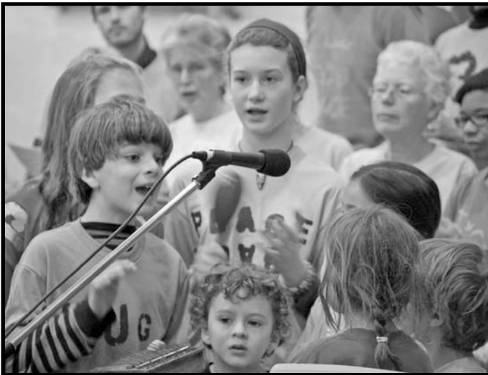
Students from the Wassookeag School created their own t-shirts and joined HOPE Festival singers.